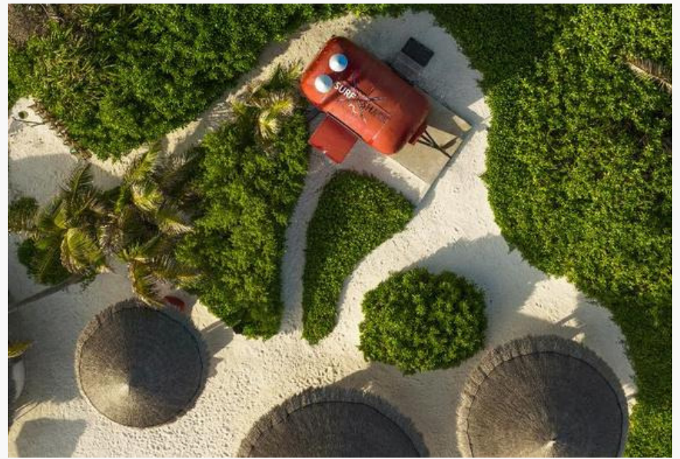
OPEN AIR LOUNGE BAR & BEACH CLUB