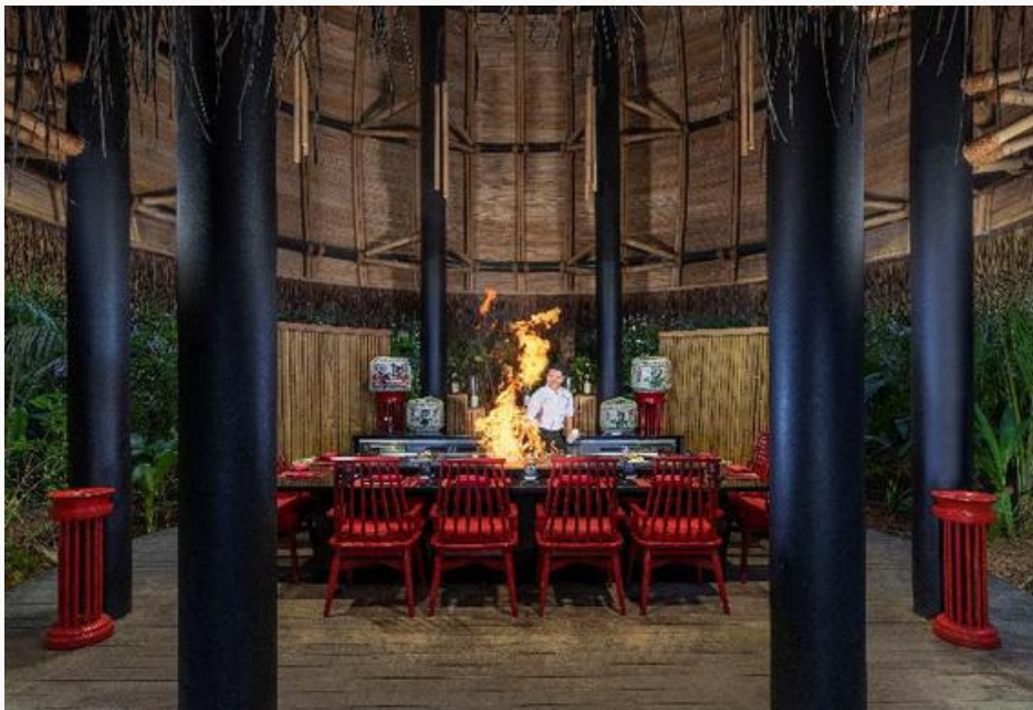
TEPPAYAKI IN THE JUNGLE