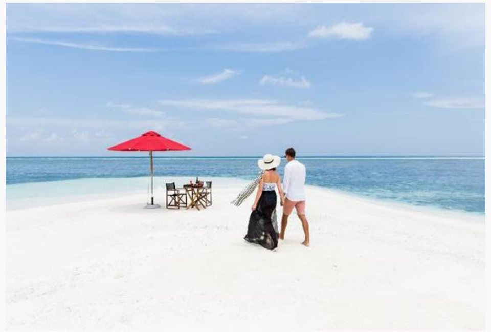
FUN COCKTAILS & WAVES