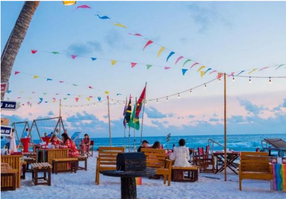
RUM RIBS & REGGAE