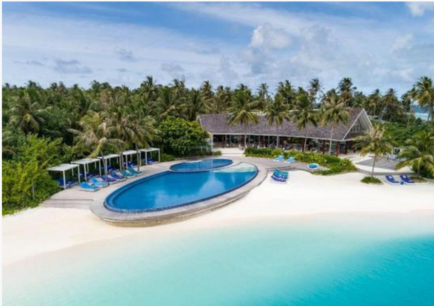
MEDITERRANIAN FAMILY STYLE ON PLAY