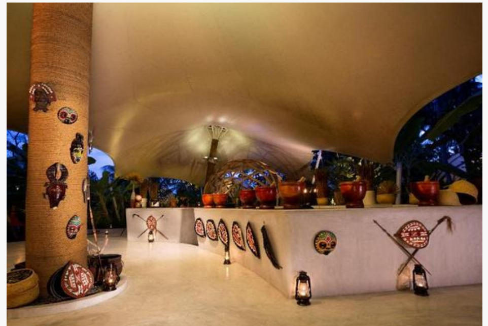
AFRO-LATIN CUISINE AMIDST BLAZING FIRES