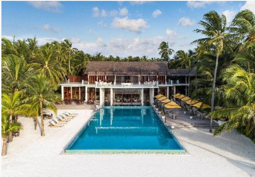
ALL DAY DINING ON CHILL